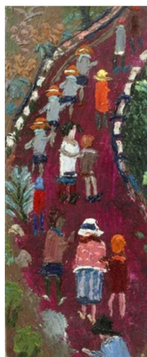
School's Out – 11 cm x 29cm