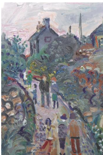
St Just, Penzance – 35cm x 55cm